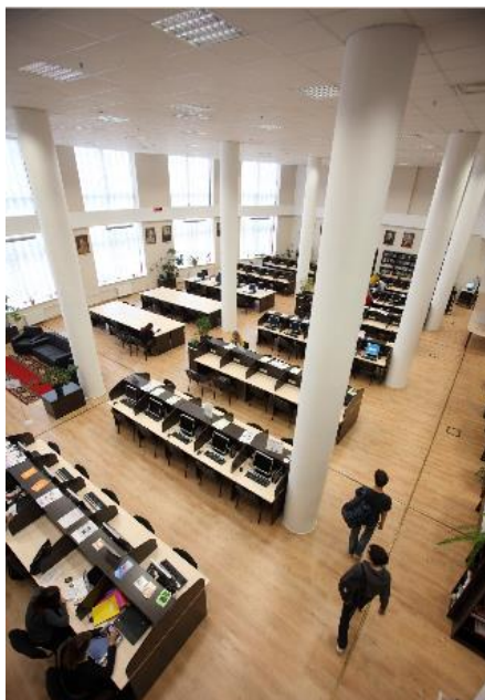
Library: reading room

The cozy atmosphere and friendly atmosphere of the reading room are combined with the comfort of workplaces and the ability to use their own portable devices (laptops, tablets, etc.). In the reading room, there is a possibility to connect to Wi-Fi network. Visitors to the reading room can use access to educational electronic library systems (EBS). We offer Russian and English-language electronic resources. In the reading room you can see the periodicals to which the University is subscribed. Visitors are given the opportunity to work in the open access to the Fund of the reading room, which allows you to find the necessary literature, as well as view the available publications in the Fund on topics of interest. In the reading room and in the hall, you can find permanent thematic exhibitions dedicated to anniversaries and significant events.