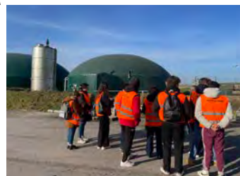
- Agricyclage Visit

Finally, students concluded the visits at CEBB on March 28th, where they exchanged with researchers from CentraleSupélec and AgroParisTech to discover their ongoing research projects.