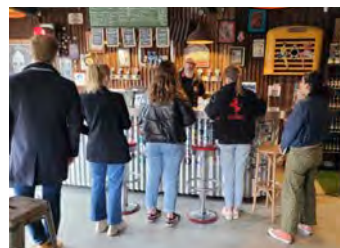
- La Bouquine Visit