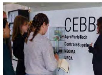
- CEBB Visit