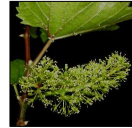
Fig. 1: Resilient new cultivars e.g. Calardis blanc