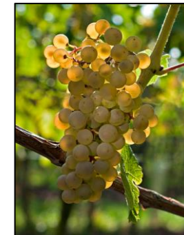
Fig. 3: Enhanced resilience toward abiotic and biotic stress (Fig. 1, 2 and 3: © JKI & URCA)