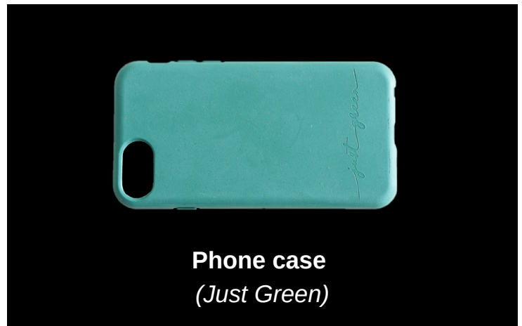
Phone case (Just Green)

Made from plants, the upper of these sneakers is made of grapes, its laces are made of cotton, its outsole is made of rubber while its insole is made of cork and natural latex.