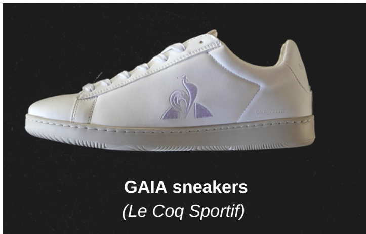
GAIA sneakers (Le Coq Sportif)

We are very pleased to announce that two new biobased objects, in partnership with Le Coq Sportif and Just Green, have joined our touring exhibition: "The Everyday Bioeconomy". A big thank you to these companies who entrust us with their products to make them discoverable to the students and to allow them to concretize what the bioeconomy is in everyday life.