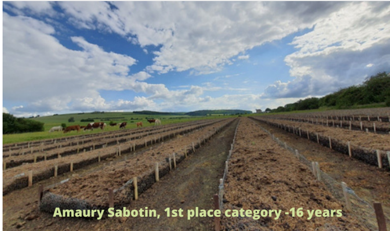
Amaury Sabotin, 1st place category -16 years

Prepare your cameras! Next edition in spring.