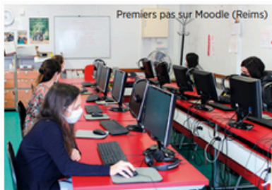
Premiers pas sur Moodle (Reims)