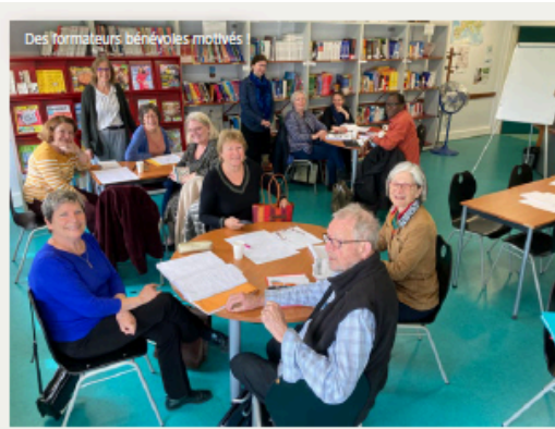
Des formateurs bénévoles motivés

De plus, la crise sanitaire nous a imposé un passage au distanciel, apportant aux stagiaires une compétence supplémentaire autour de l'e-formation, vecteur d'employabilité. Ainsi les formateurs ont approfondi leur expérience numérique. L'expérience s'est avérée positive tant pour les stagiaires, qui pour certaines ont déjà signé un CDI, tant pour nos étudiants qui ont pu bénéficier de leur présence, tant pour le CIEF qui s'est professionnalisé en s'ouvrant des horizons sur le monde du travail et ses acteurs. ■